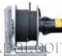
Electric Cable Winder