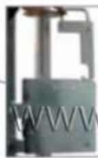
Floor Gate Key